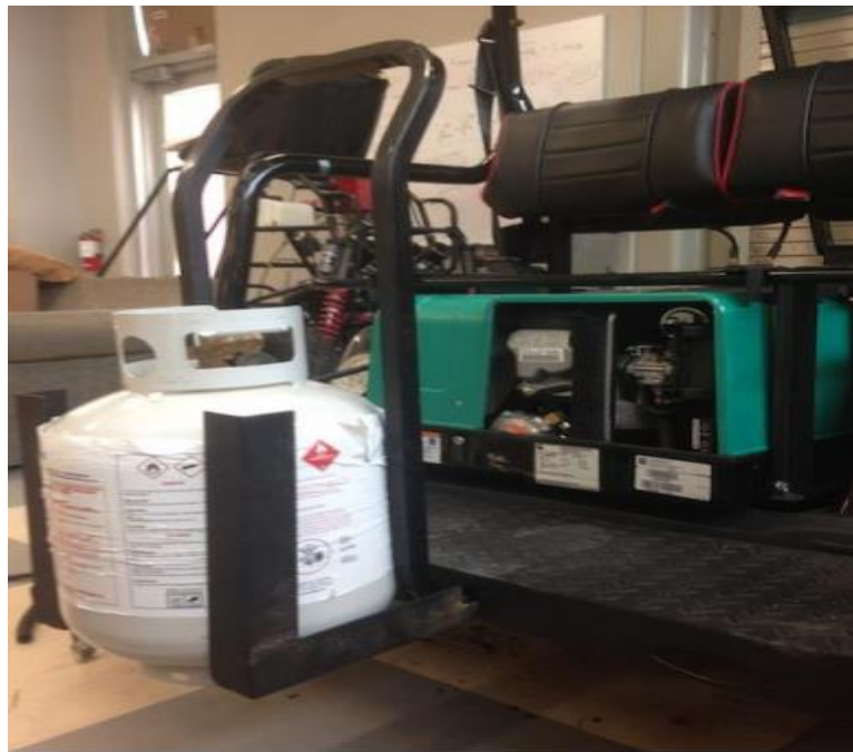
Figure 2. Propane tank mount and location