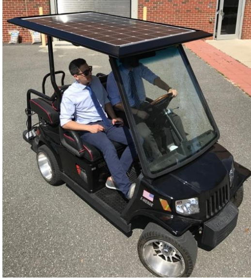
Figure 3. Electric vehicle with solar panel installed