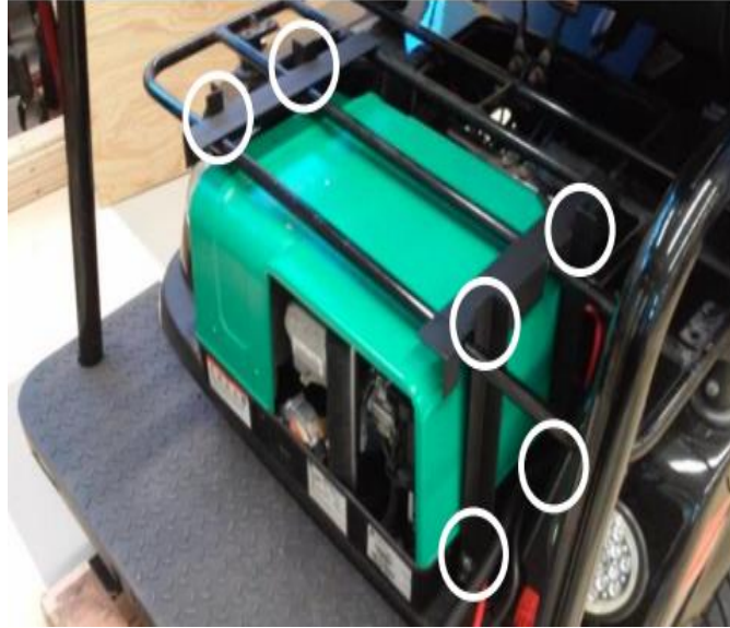
Figure 1. Generator location and mount